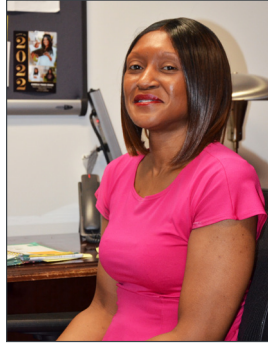
Director & Supervising Attorney of the Juvenile Law Clinic

The NCCU Juvenile Law Clinic was established in recognition of the large number of Durham County Youth who need quality legal representation and other services. The Juvenile Clinic provides three services including legal representation in delinquency hearings, legal representation for youth in Durham Public Schools suspension hearings and referrals to community resources.