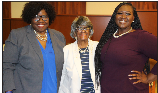
A NIGHT IN AFRICA - CULTURAL CELEBRATION