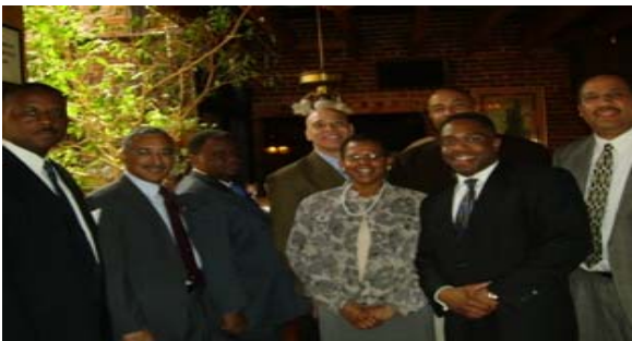
Richmond, VA Aquila Fundraiser - February 15, 2008