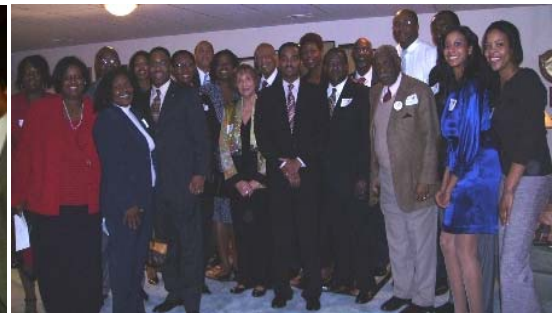
Atlanta, GA Aquila Fundraiser - February 18, 2008

*Aquila, a magnificent eagle, earned his place in the sky for being extremely loyal.