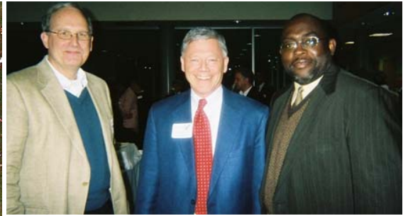
Raleigh-Durham Aquila Fundraiser - January 25, 2008