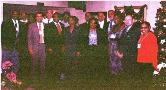
Lumberton, N.C. Aquila Fundraiser - December 13, 2007

Invitations will be mailed to Raleigh area and New Bern area alumni, April 2nd.