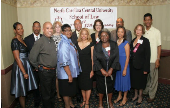
Alumni from the Class of 1984, celebrating their 25th Anniversary weekend.